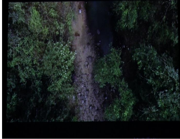
Short film Telecast