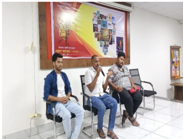
Other Chief Guest Guidance of Short Film Festival